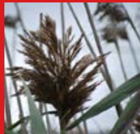
Invasive Species - “ Phragmites australis ”

Environmental Protection Agency - Landscaping Tips