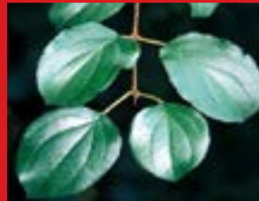
Invasive Species - Common Buckthorn “ Rhamnus cathartica ”